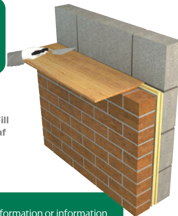
Figure 2 - Use of Eco-Cavity Full Fill when installing the inner wall leaf

To access pre-existing product information or information relating to previously sold/discontinued products please email marketing@ecotherm.co.uk .