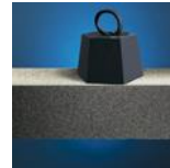
High compressive strength