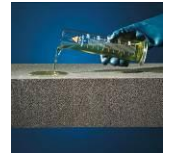
Acid resistant / chemical resistant